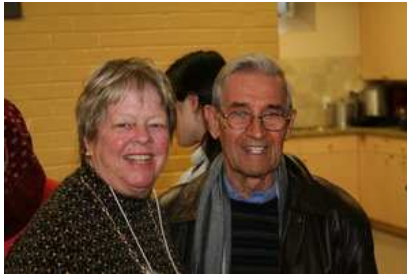
Fairlawn Book Sale 2011, covered by SNAP North Toronto