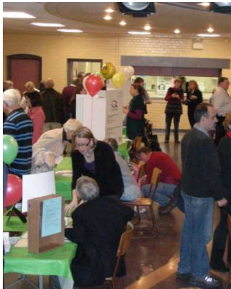
First Fairlawn Volunteer Fair, 2011